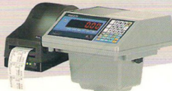
◀ PRR-302TD Thermal Line type