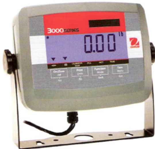
T31P Indicator shown with optional bracket