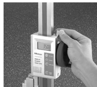
Large clamp lever