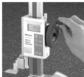
Smooth slider feed wheel